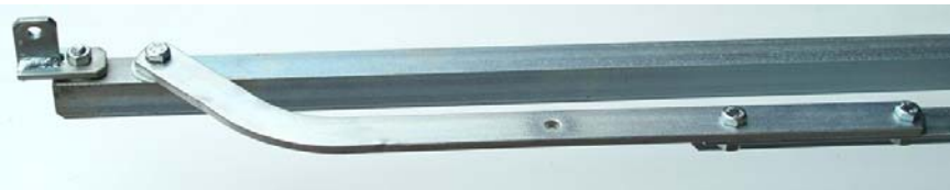
Arms shown configured for LH leaf to close first (when viewed from inside)